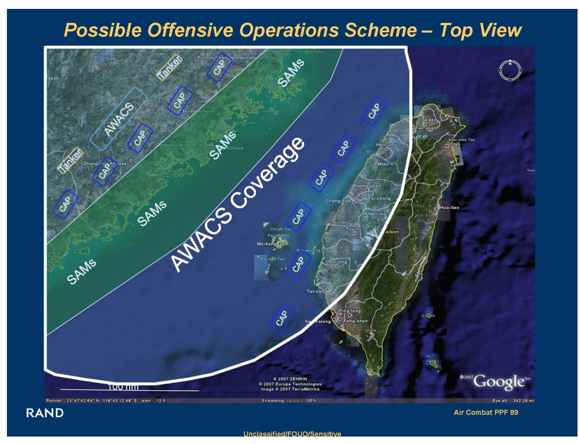
Figure 3 Both this and the following slide are taken from the brief placed on the web by Steve Trimble

Seventh, the tanker vulnerability identified in the study is a very good argument for the next generation tanker. The tanker selected by the USAF in 2008 (the NG A330) would deploy further from the strike area, be able to remain aloft indefinitely (with crew rest areas) and capability to be re-fueled while deployed, and would provide an important force multiplier for the 5<sup>th</sup> generation fleet. This fleet operates as a combined strike, ISR and communications asset and as such needs to stay on deployment as long as the pilot's duration allows, not simply with regard to how large the plane's weapons load is.