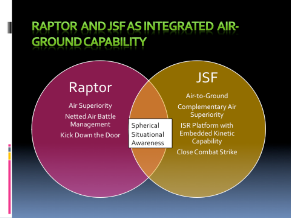
Figure 2 Graphic by Robbin F. Laird Based on Discussion with the USF, USMC, Lockheed Martin and Northrop Grumman

But the limited numbers of the F-22 will ensure that the F-35 will be the dominant 5<sup>th</sup> generation aircraft both in terms of numbers and availability in a coalition environment.<sup>6</sup> From the standpoint of thinking through 21<sup>st</sup> century air operations, the ability of the F-22 and F-35 to work together and to lead a strike force will be central to U.S. core capabilities for projecting power. And it is to be remembered that the F-35 is coming off of USAF airfields, allied airfields, USN carriers, and, in the case of the F-35B, virtually anywhere close to the action.