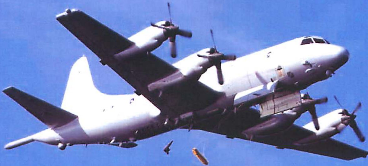
Air Sea Rescue Kit drop from an AP-3C Orion © CPL Nicci Freeman, Commonwealth of Australia, Department of Defence, May 2014

« Preparedness, based on certain levels of readiness and sustainability levels, is what drives our stockholdings »