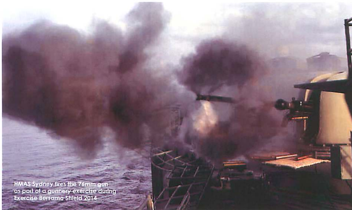
HMAS Sydney fires the 76mm gun as part of a gunnery exercise during Exercise Bersama Shield 2014