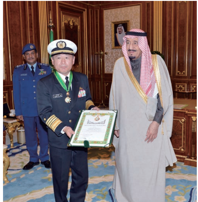
MSDF Chief of Staff Katsutoshi Kawano received a decoration from Prince Sultan bin Abdulaziz, Crown Prince of Saudi Arabia

See Reference 55 (Recent Defense Cooperation and Exchanges with European Nations and Others (Past Three Years))