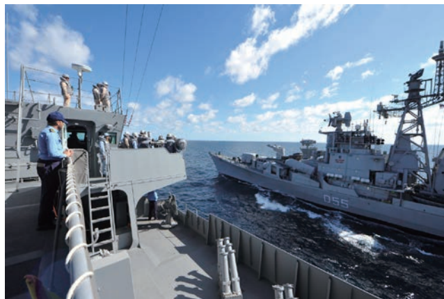
MSDF Escort Ship Setogiri (front) and Indian Navy Vessel INS Ranvijay conducting the Japan-India Joint Exercise

See Reference 50 (Recent Defense Cooperation and Exchanges with India (Past Three Years))