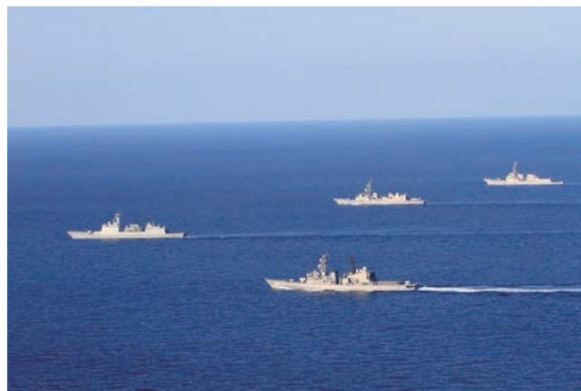
MSDF destroyers and other vessels conducting a Japan-U.S.-ROK trilateral exercise in the Gulf of Aden (from the front to back, MSDF destroyer Setogiri, ROK Navy vessel Choi Young, MSDF destroyer Ariake, and U.S. Navy destroyer Bulkeley).

ROK in this way, in order to contribute to the peace and stability of the region.