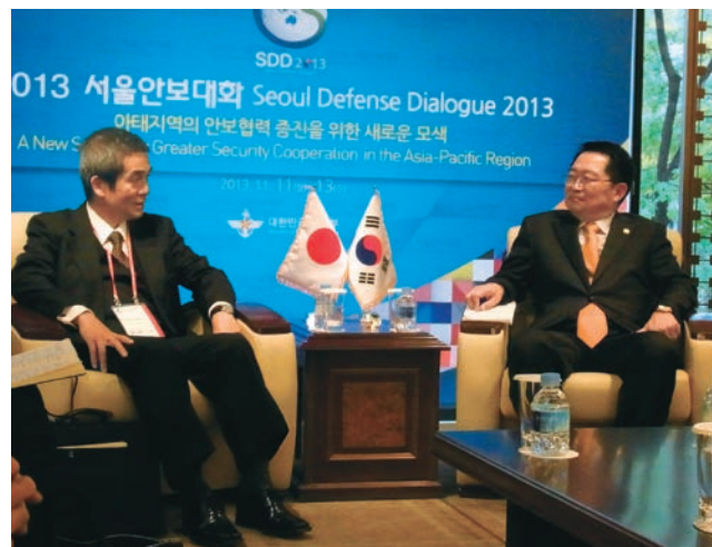
Japan-ROK Defense Vice-ministerial Meeting at the Seoul Defense Dialogue

See Reference 49 (Recent Defense Cooperation and Exchanges with the ROK (Past Three Years))