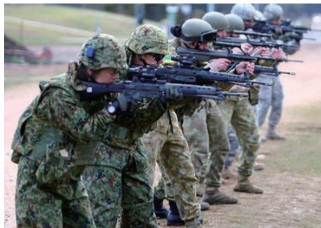
GSDF personnel participating in the Japan-U.S.-Australia trilateral exercise "Southern Jackaroo"

In terms of training and exercises, the MSDF, the U.S. Navy, and the Royal Australian Navy held a joint exercise in waters around Guam in June 2013. In February 2014, the ASDF, the U.S. Air Force, and the Royal Australian Air Force conducted the joint exercises Cope North Guam, and in May 2014, the GSDF, the U.S. Army, and the Australian Army held the joint exercise Southern Jackaroo.