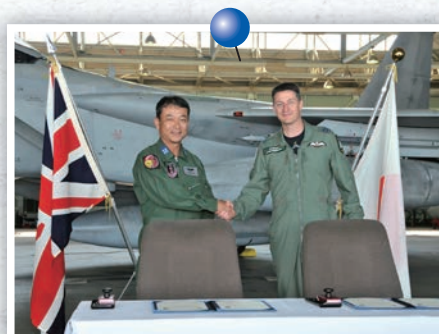
The two squadron commanders who completed a signing ceremony for becoming sister squadrons.