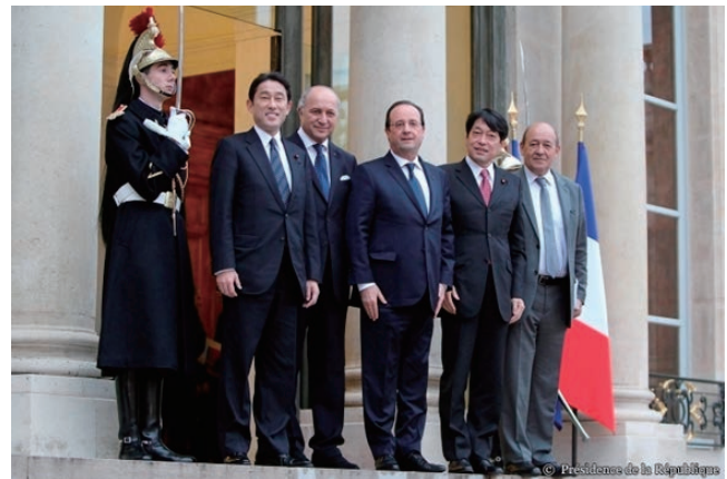
Japan-France Foreign and Defense Ministerial Meeting

As for service to service exchanges, in August 2013, the Chief of Staff of the MSDF visited France, and in March 2014, the Chief of Staff of the Joint Staff visited the country for the first time in about 14 years, and exchanged opinions regarding the security situations in the regions of both countries' interest as well as defense cooperation and exchanges between Japan and France.