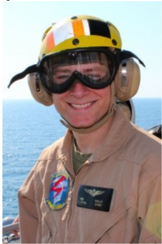
Squirt Kelly Aboard the USS Wasp during F-35B Sea Trials, October 18, 2011

As the F-35 moves into squadrons in different nations with different potential combat challenges around the globe all fighter pilots share a unity of purpose. Using the trite cliché "global commons" does not come close to what is occurring.