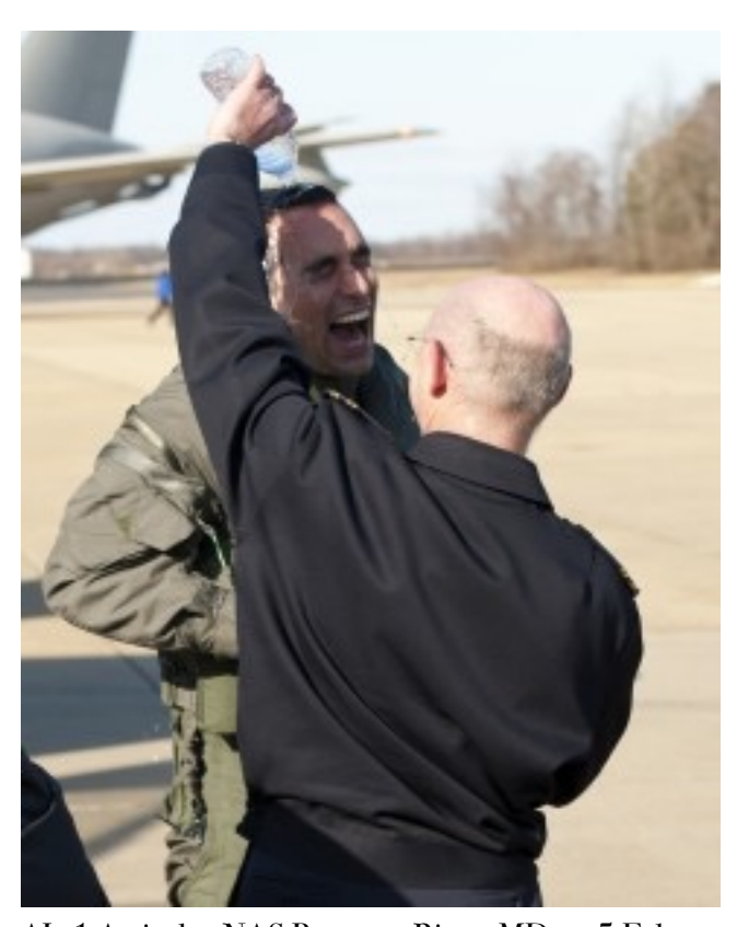
AL-1 Arrival at NAS Patuxent River, MD on 5 February, 2016. This was the first time a foreign assembled F-35 to land on US soil.

Every generation of test pilots flying the latest T/M/S fighter addition to their service at both Patuxent River Naval Air Station and the USAF Test Center at Edwards AFB have the most fundamental question always asked by their leaders— How to hold them back?