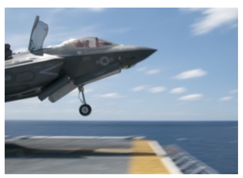
150522-N-BQ308-110 ATLANTIC OCEAN (May 22, 2015) As fast as its name, an F-35B Lightning II screams past a flight deck handler as it takes off during flight operations aboard the amphibious assault ship USS Wasp (LHD 1).

Once an aviator in any nation has achieved the distinction that the leadership thinks they are ready to go to war, they either enter a combat theater, or must continue in demanding proficiency training. Also after their first tour because they may have been cycled out of flying for another assignment, a fighter pilot eventually returning to the cockpit must begin proficiency training all over again.