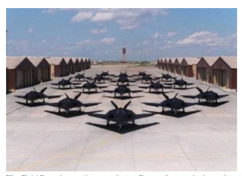
The F-117 was key strike asset during Desert Storm which combined stealth with precision strike..

Aircrews must be adaptable enough to follow changing commands from leadership and also, on their own initiative, to change tactics to achieve local surprise and exploitation. Like the quote in Animal House: "knowledge is good." In the cockpit, it can be a lifesaver and aid in mission accomplished.