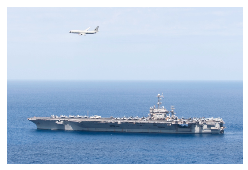
FIGURE 14 P-8 FLIES BY USS HARRY S. TRUMAN OFF OF THE EAST COAST OF THE UNITED STATES, JUNE 25, 2015.

As September drew to a close; so did the Harry S. Truman Composite Training Unit Exercise (COMPTUEX). During the exercise, the "Mad Foxes" of VP-5 and "Fighting Tigers" of VP-8 provided real time support for antisubmarine warfare (ASW), anti-surface warfare (ASuW), and maritime Intelligence Surveillance and Reconnaissance (ISR) to the Carrier Strike Group (CSG) 8.