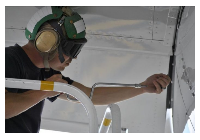
FIGURE 10 MECHANICS WORKING ON P-8. Second Line of Defense

As he put it: "I don't have children, but if I did I could imagine this would be like having a child and raising it and watching it grow up and go off to college and be successful."