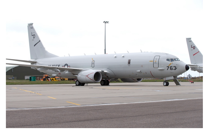
FIGURE 5 P-8 AT JOINT WARRIER EXERCISE 2016 AND SEEN AT RAF LOSSIEMOUTH.

Norway is interested as well in the P-8 which then create a significant interlocking force. For Norway, because the P-8 is not a P-3, they would benefit from seeing much deeper into the maritime space to protect their interests. It is not just about flying to an area of interest and patrolling it. When you take off with the P-8 you link into the data network and are on station when you take off.