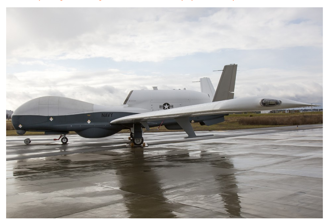
FIGURE 7 TRITON AT PAX RIVER.

This is a visionary foundation for the evolution of the software upgradeable platforms they are flying as well as responding to technological advances to work the proper balance by manned crews and remotes.