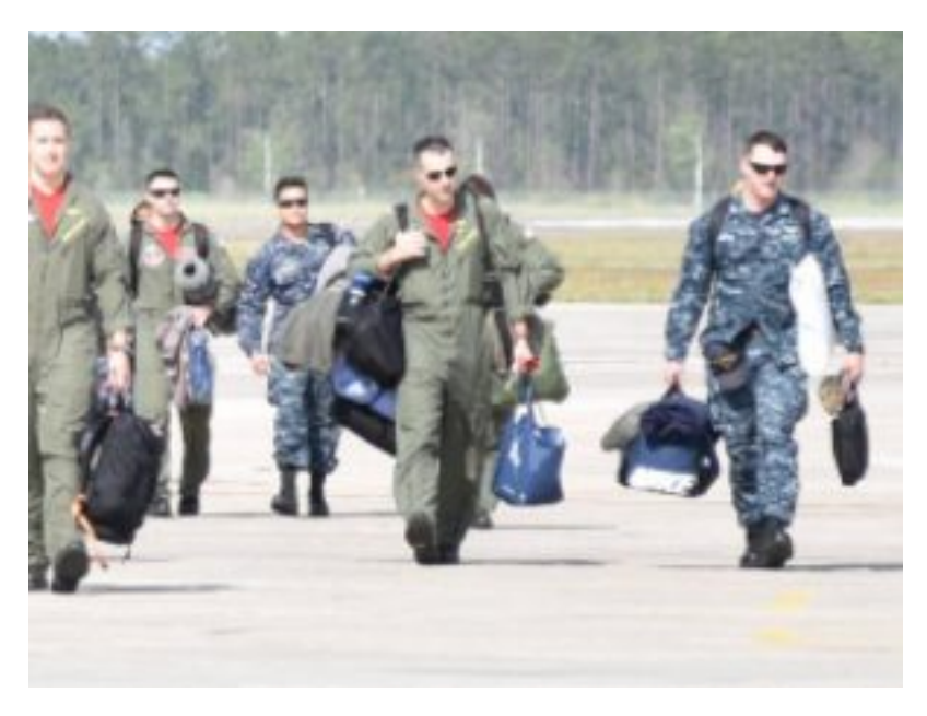
FIGURE 6 VP-16 HOME FROM DEPLOYMENT, 2016.

We were having difficulty with our media, and the P-8 is very media dependent; if the media is not working properly, the plane is not going to work properly.