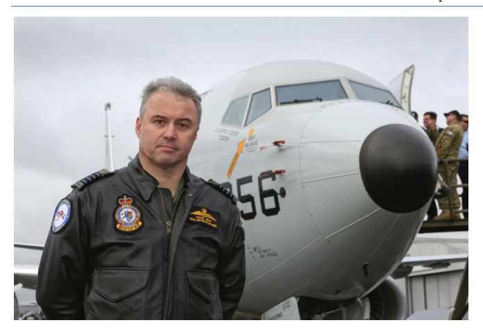
FIGURE 16 THEN THE OFFICER COMMANDING NO. 92 WING, GROUP CAPTAIN CRAIG HEAP, STANDS BEFORE A USN P-8 ON THE FLIGHT LINE AT EDINBOURGH. CREDIT: AUSTRALIAN MOD 2012

We need to have open system architectures with the flexibility to spirally add capabilities at speed, not be hamstrung by a 5-year acquisition cycle. If ISIS has an acquisition cycle, and I believe it does, it certainly isn't as limited as our previous processes.