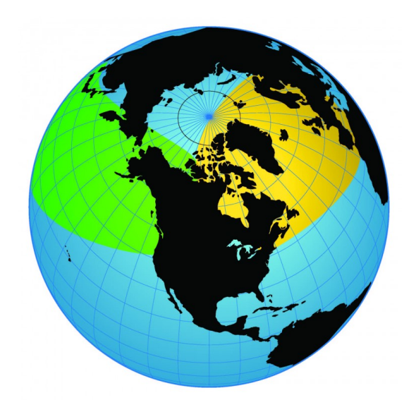
FIGURE 11 THIS IS A NOTIONAL RENDERING OF THE 10 AND 2 O'CLOCK CHALLENGE. IT IS CREDITED TO SECOND LINE OF DEFENSE AND NOT IN ANY WAY AN OFFICIAL RENDERING BY ANY AGENCY OF THE US GOVERNMENT. IT IS MEANT FOR ILLUSTRATION PURPOSES ONLY.