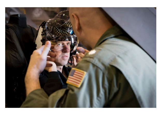
FIGURE 1 CNO ADMIRAL RICHARDSON IN COCKPIT OF AN F-35C AT NAVAL AIR STATION PAX RIVER, JANUARY 13, 2016.

Perhaps it would be better to describe our software approach as one of agile development, of taking a stable foundational software system and evolving its capabilities over time as the plane operates, and inputs come back with regard to what are the most desirable next steps."