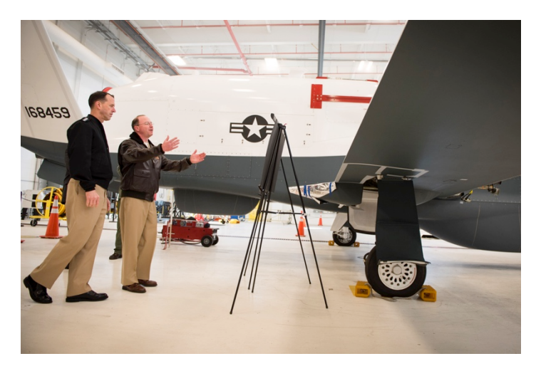
FIGURE 2 CNO ADMIRAL RICHARDSON VISITING NAVAL AIR STATION PAX RIVER JANUARY 13, 2016 AND BEING BRIEFIED ON THE TRITON.

The combat learning cycle undergone by the P-8 Wing and by the coming Triton squadrons is convergent with the software upgradeable nature of the new air systems.