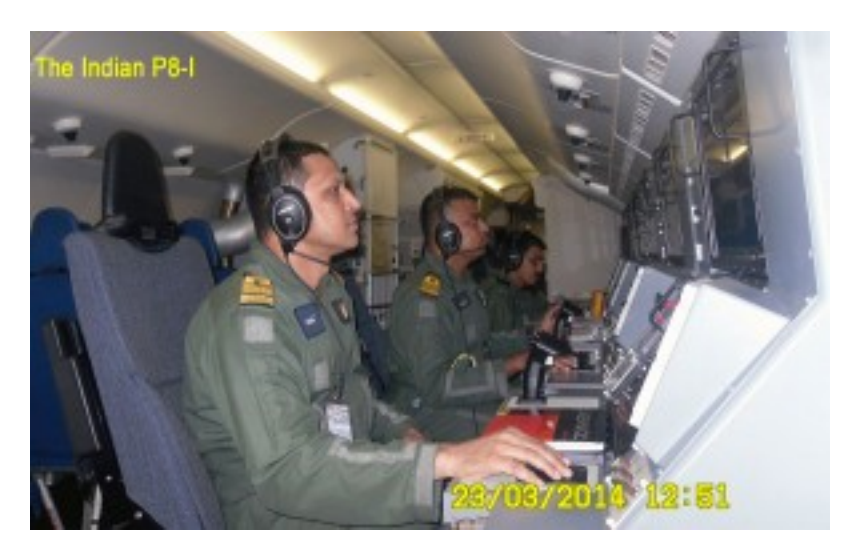
FIGURE 17 INDIAN P-8 DURING SEARCH FOR MALAYSIAN AIRLINES FLIGHT 370.

One of the more intriguing aspects of the attack is how the teams entered Mumbai. Reports indicate at least two of the assault teams arrived from outside the city by sea around 9 p.m. local time. Indian officials believe most if not all of the attackers entered Mumbai via sea.