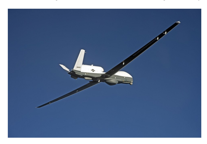
FIGURE 4 TRITON IN FLIGHT.

We're finding that the aircrews are making that leap with really no issue.