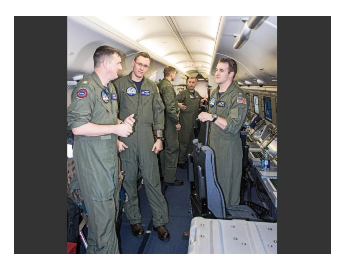
FIGURE 9 P-8 AT RED FLAG.

Instead of training on safety and NATOPS being the center focus of attention, we're now able to focus on the tactics."