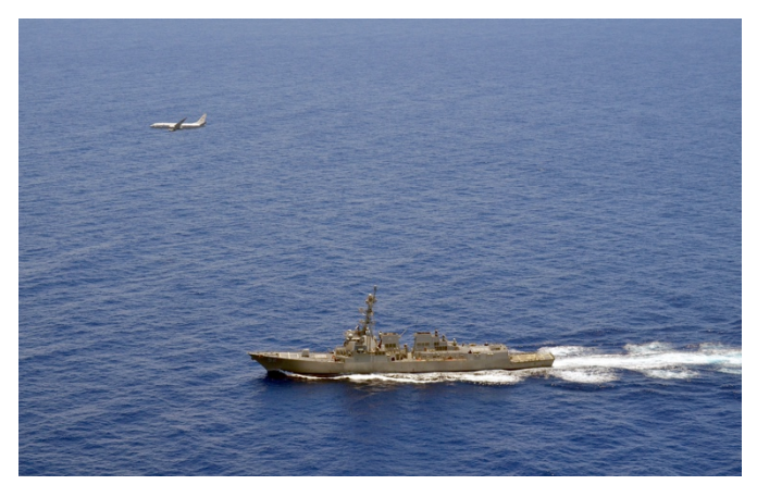
FIGURE 8 P-8 FLIES OVER THE GUIDED-MISSILE DESTROYER USS MOMSEN IN THE SOUTH CHINA SEA JUNE 29, 2016. CREDIT: USN

The world looks differently at each altitude but by rotating crews, a unique perspective is gained by operating at the different altitudes and with different operational approaches to gain knowledge dominance."