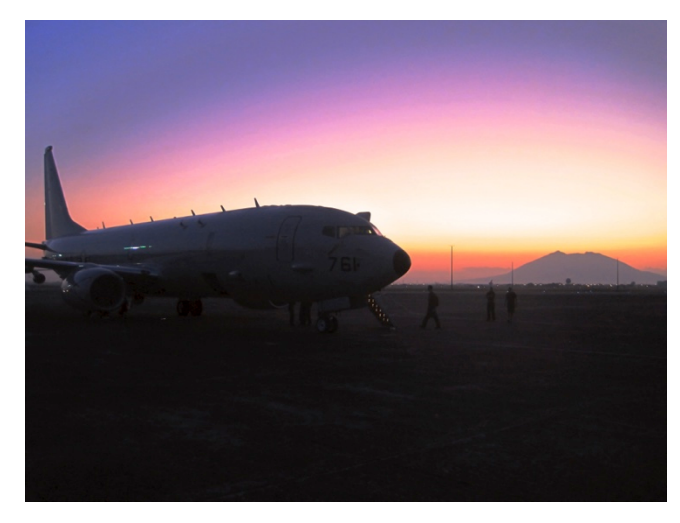
FIGURE 3 CLARK AIR BASE, PHILIPPINES, APRIL 9, 2015. P-8 PARTICIPATING IN EXERCISE BALIKATAN 2015.

In our discussion with Captain Corapi, he discovered how the evolution of the P-8/Triton dyad was subsuming within it several of the earlier capabilities flown by the US Navy to do ASW but was doing so from the standpoint of creating a whole new digital capability, one which could be seamlessly integrated with the air and maritime forces.