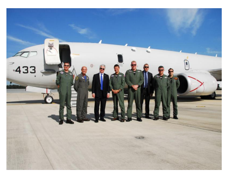
FIGURE 13 UK DEFENCE MINISTER VISITING P-8 SQUADRONS AT JAX NAVY.

Faulds explained that Project Seedcorn consists of 11 RAF personnel (two pilots, four TACCOs and five EWOs) who have trained on U.S. Navy P-8A aircraft embedded with Fleet Replacement Squadron VP-30 personnel since 2012.