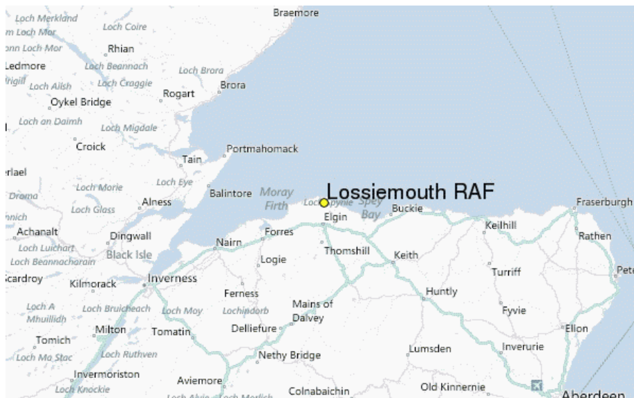
FIGURE 1 RAF LOSSIEMOUTH IS LOCATED IN SCOTLAND DIRECTLY FACING THE NORTH SEA

Additional units at RAF Lossiemouth include No 5 Force Protection Wing of the RAF Regiment. 5 Force Protection Wing includes a regular field squadron, 51 Squadron RAF Regiment, and a reserve squadron, 2622 Squadron of the Royal Auxiliary Air Force Regiment.