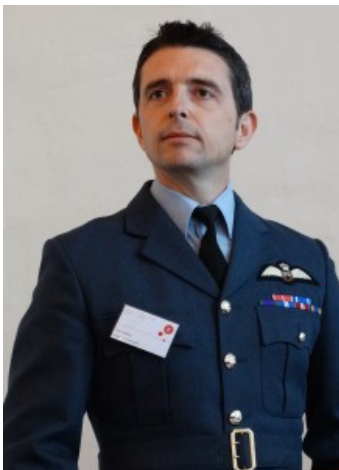
FIGURE 8 GROUP CAPTAIN PAUL GODFREY ADDRESSING THE COPENHAGEN AIRPOWER SYMPOSIUM, APRIL 17, 2015.

We are dealing with a different generation of pilots.