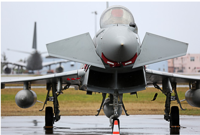
FIGURE 2 TYPHOON INVOLVED IN JOINT WARRIOR 2016 EXERCISE.

Question: Reliability rates for the Typhoon in Operation Shader have been good?