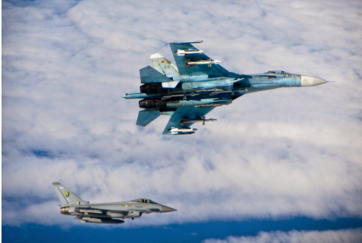
FIGURE 3 A TYPHOON INTERCEPTING A RUSSIAN AIRCRAFT. CREDIT: RAF

We instill in the guys that we train to always think about Control of the Air.