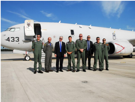
FIGURE 7 THE BRITISH MINISTER OF DEFENCE DURING A VISIT TO JAX NAVY LAST YEAR.

“If we don’t, then you end up making problems for your F-35, your Typhoon, your P8, your Reaper, your Son of Reaper.”