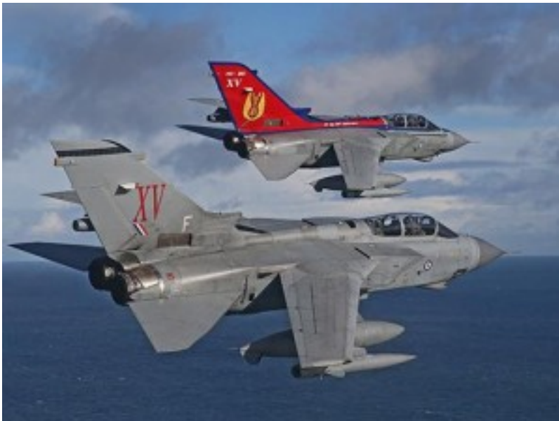
FIGURE 6 100TH ANNIVERSARY OF THE SQUADRON 2015.

The photo below was shot last year at the time of the 100 th anniversary of the squadron.