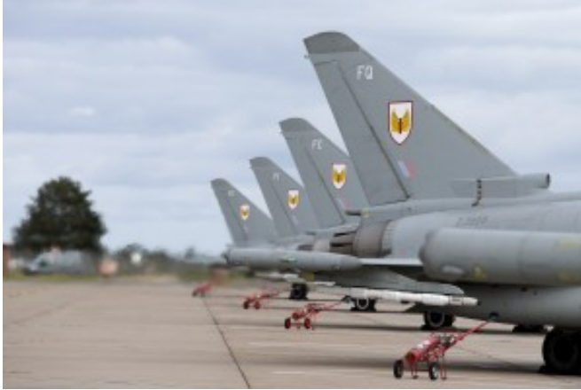
FIGURE 4 TYPHOON AIRCRAFT WHICH RELOCATED TO RAF LOSSIEMOUTH NUMBER 1 FIGHTER SQUADRON WITH A SPECIAL 8-SHIP FORMATION IN THE SHAPE OF A NUMBER 1. THEY RELOCATED FROM RAF LEUCHARS IN SEPTEMBER 2014.

And we provided close air support to our ground forces, and provide information to the ground forces to support their operations, with targeting information provided from the ground maneuver forces, or from our onboard sensors.”