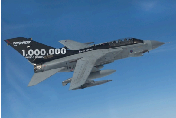
FIGURE 5 HERE THE TORNADO FLEET MARKS ITS 1,000,000 FLIGHT HOUR IN 2011.

The weapons aboard Tornado are transitioning to Typhoon and to the F-35, but the operational envelope of the Tornado is different and it is a two seat aircraft with a weapons systems officer in the second seat.