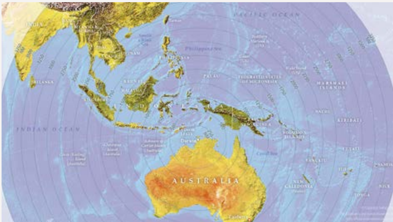
Australia and the Asia-Pacific region.

Strategic risk is a grey area in which governments need to make critical assessments of capability, motive and intent. Over recent decades, judgements in this area have relied heavily on the conclusion that the capabilities required for a serious assault on Australia simply did not exist in our region. In contrast, in the years ahead, the level of capability able to be brought to bear against Australia will increase, so judgements relating to contingencies and the associated warning time will need to rely less on evidence of capability and more on assessments of motive and intent. Such areas for judgement are inherently ambiguous and uncertain.