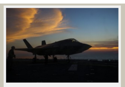
An F-35B Lightning II awaits refueling before a night operations exercise during F-35B Operational Testing (OT-1) aboard USS Wasp (LHD-1) May 20, 2015. Over the course of about two weeks, U.S. Marines, U.K. military and industry partners will evaluate the full spectrum of F-35B measures of suitability and effectiveness, as well as assessing the integration of the aircraft into the spectrum of amphibious-based flight operations.

It is turning what was a Greyhound Bus role to shaping an entirely new strike capability appropriate for 21<sup>st</sup> century operations.