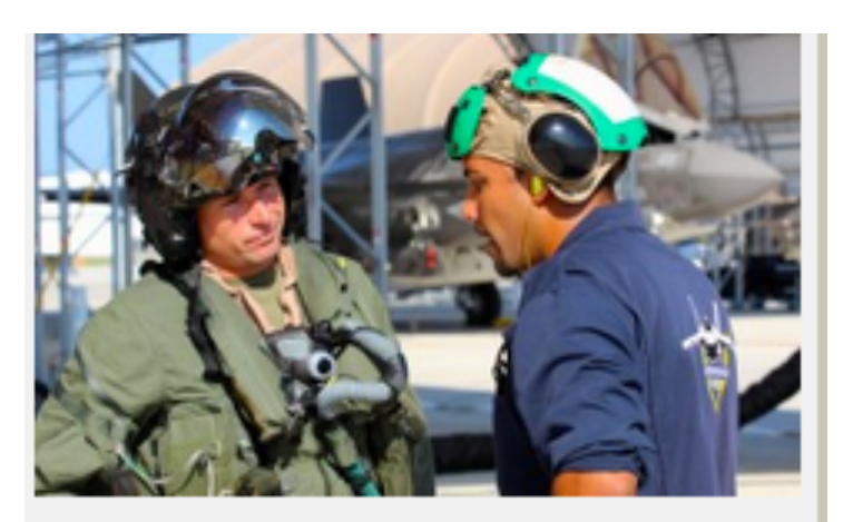
OD Bachmann after 200th F-35 Sortie in August 2012.

The current planes are operating with Block 2A software and the Block 2B software arrives later this year for the preparation for the IOC in 2015. What this means is that the plane operating today with MAWTS is more limited than what will come later in the year. While Block 2B is largely a software upgrade, there are some planned hardware mods as well.