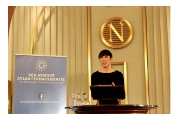
Figure 10 The Defense Minister Speaking at the Leangkollenseminaret 2017 Conference.

Russia's illegal annexation of Crimea and the following and continuing destabilization of Eastern Ukraine changed the European security landscape almost overnight.