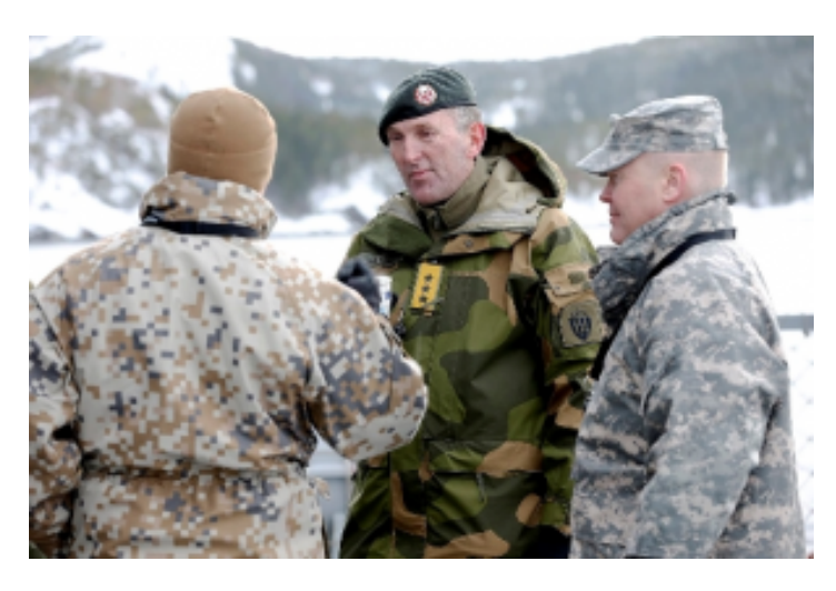
Figure 8 Commander of the Norwegian Joint Headquarters Lieutenant General Rune Jakobsen in conversation with foreign colleagues during exercise Cold Response 2016 – Photo courtesy of Torbjørn Kjosvold/Forsvaret

"To date we see the Northern Fleet behaving professionally towards us. There are no border violations, no violations of Norwegian airspace. Their training activity is understandable given that they have modernized their armed forces.