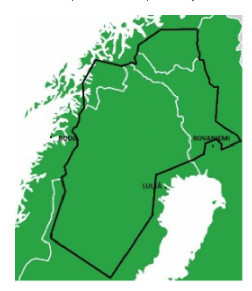
Figure 5 Arctic Exercise Area.

This year's Arctic Challenge Exercise (ACE 17) is the third of its kind that Finland, Norway and Sweden have organised together. The exercise conducted every second year since 2013 is this time led by the Finnish Air Force that is responsible for planning and direction of the training event.