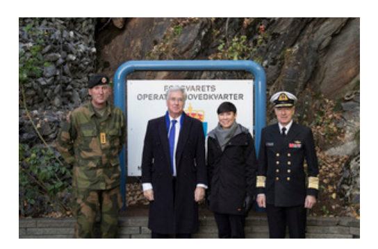
FIGURE 2 UK DEFENCE SECRETARY SIR MICHAEL FALLON WITH INE MARIE ERIKSEN SØREIDE, THE DEFENSE MINISTER OF NORWAY, OUTSIDE OF NORWAY'S JOINT HEADQUARTERS.

\frac{\text{https://www.ainonline.com/aviation-news/defense/2016-12-06/norway-acquire-p-8s-boeing-delivers-australia}{\text{defense/2016-12-06/norway-acquire-p-8s-boeing-delivers-australia}}