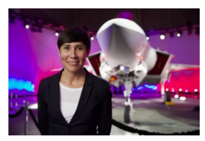
Figure 4 Norway's Minister of Defence, Ine Eriksen Søreide, in front of the country's first F-35 combat aircraft.

What one saw with the Norwegian presentations and discussions both public and private was a clear focus on shaping a new approach to national defense and one which needed to have plug and play capabilities with core allies to ensure that both the extended defense of Norway could be ensured as well as enhancing Norway's contribution to Northern tier NATO defense.